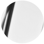
Stainless Steel (Polished)